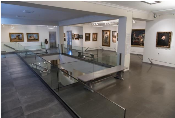
Averoff Museum, Metsovo