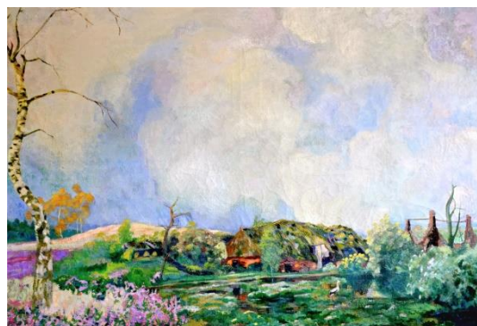
E. Verstraeten. Ferme brûlée, 1951. Coll. Privée