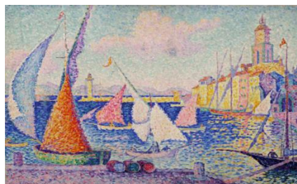
Paul Signac. Saint Tropez, le quai. Musée de l'Annonciade