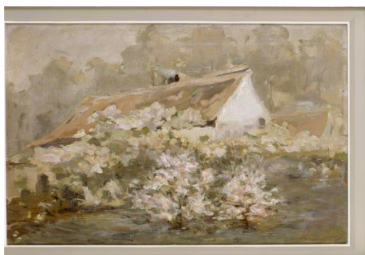
Periclès Pantazis. Les Amandiers en Fleurs Pinacothèque Averoff, Metsovo, Grèce