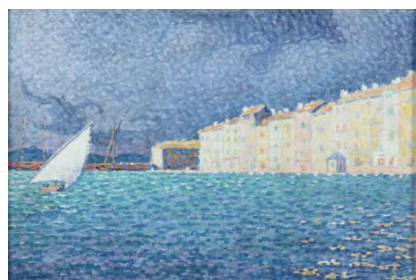
Paul Signac. Saint-Tropez, l'Orage. Musée de l'Annonciade