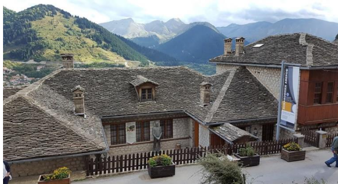
La Pinacothèque Evangelos Averoff à Metsovo

The Municipal Art Gallery of Larissa (Katsigras Museum) and the Evangelos Averoff Foundation (Athens and Metsovo) have joined the Impressionisms Routes® network on the occasion of the publication of our new book Impressionism in Europe which includes an important chapter on Greece. A fine example of cooperation opening up new perspectives within the framework of the values of the Council of Europe